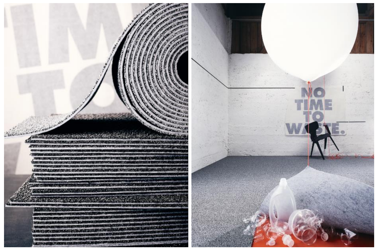
NEOO is available as tiles or broadlooms.