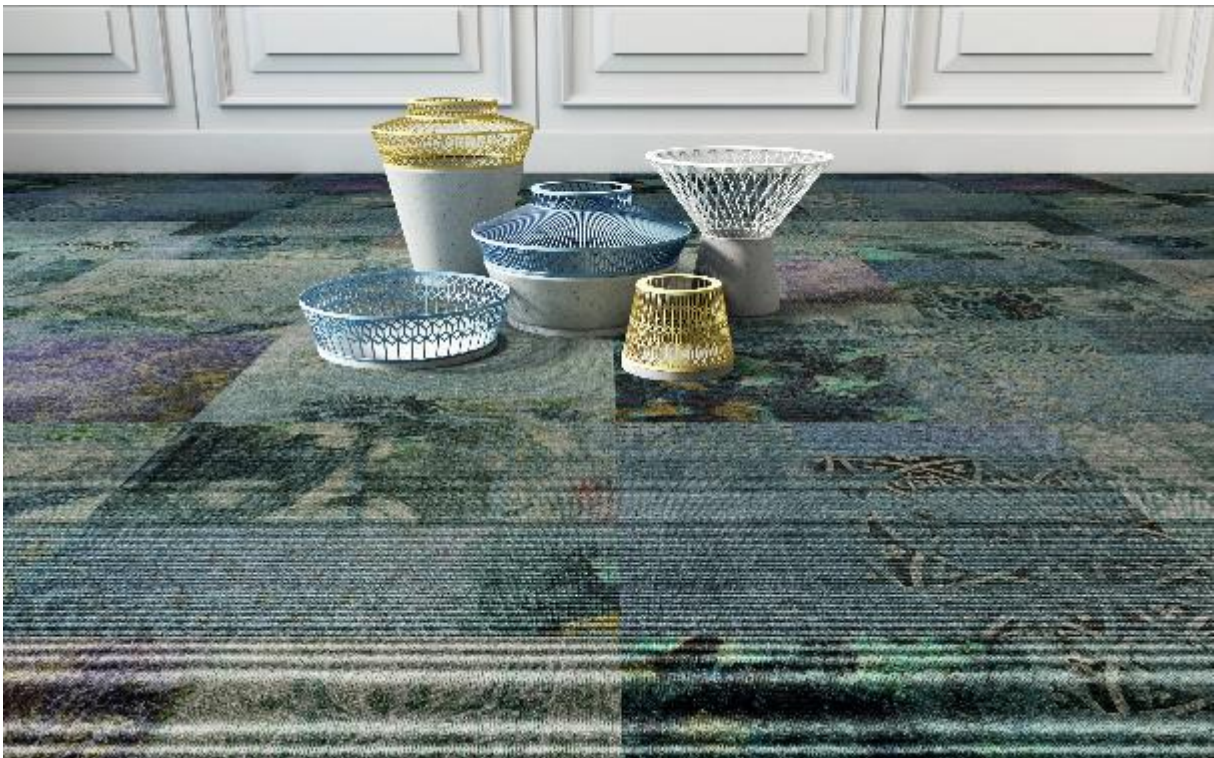
FREESTILE HELSINKI 0168 | © patel kommunikative inszenierung