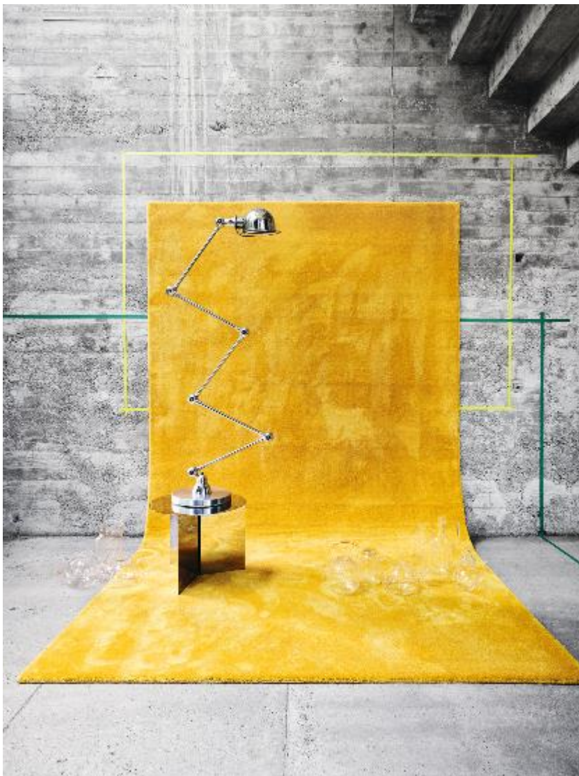
RUGX SILKY SEAL 1211