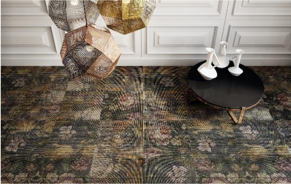
FREESTILE ABERDEEN 1001