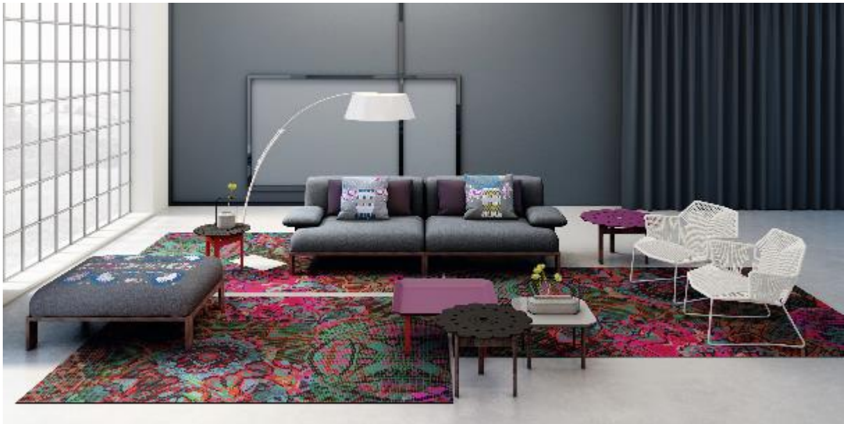
RUGXSTYLE MARAKESH 012