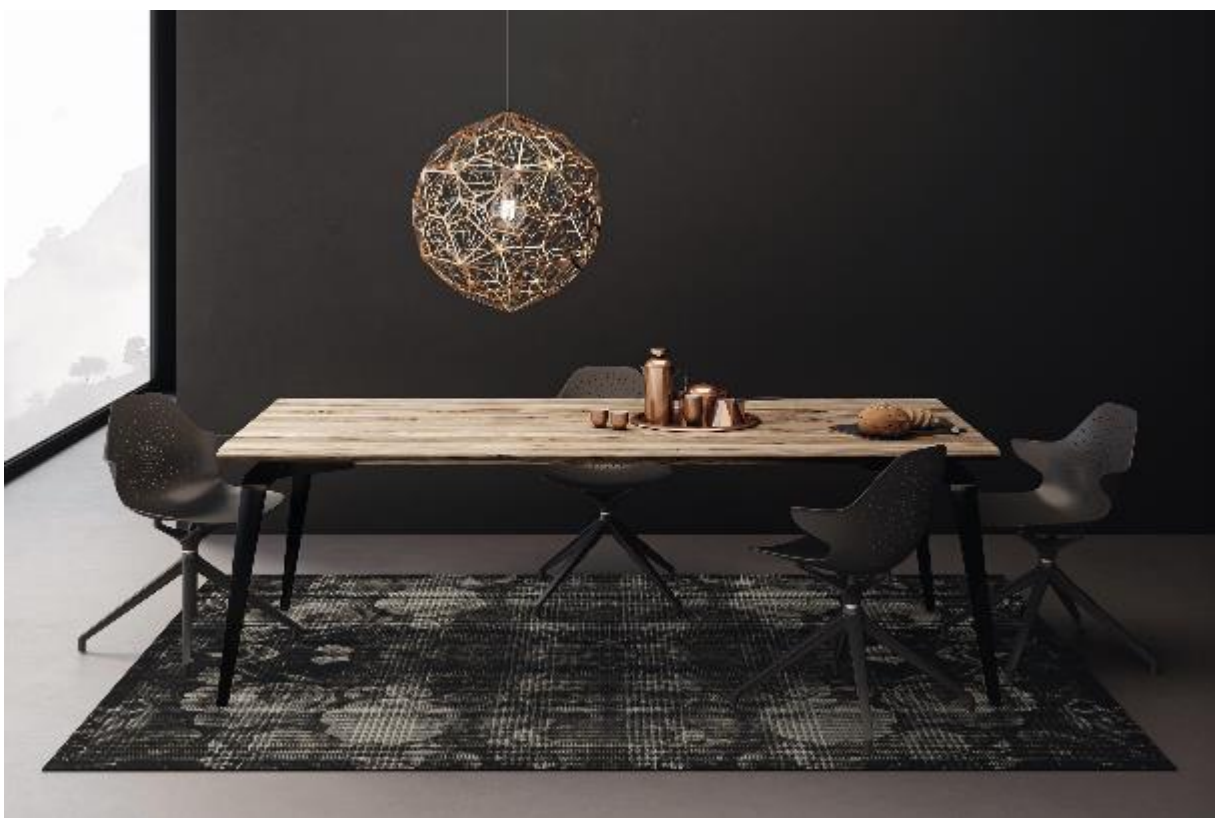
RUGXSTYLE ABERDEEN 0321