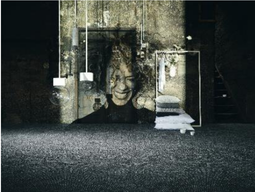
NEWCON 1852