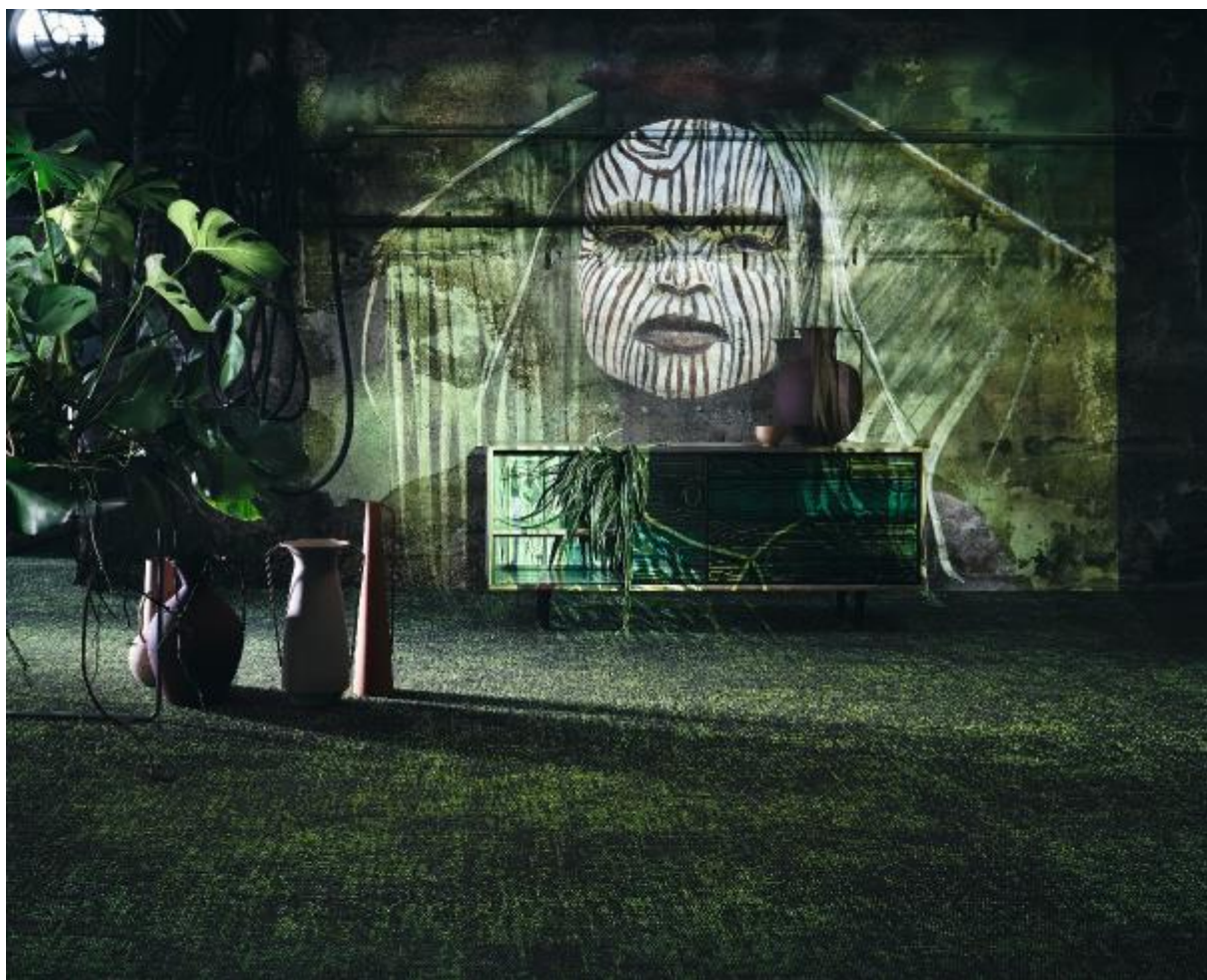
XPOSIVE 1840