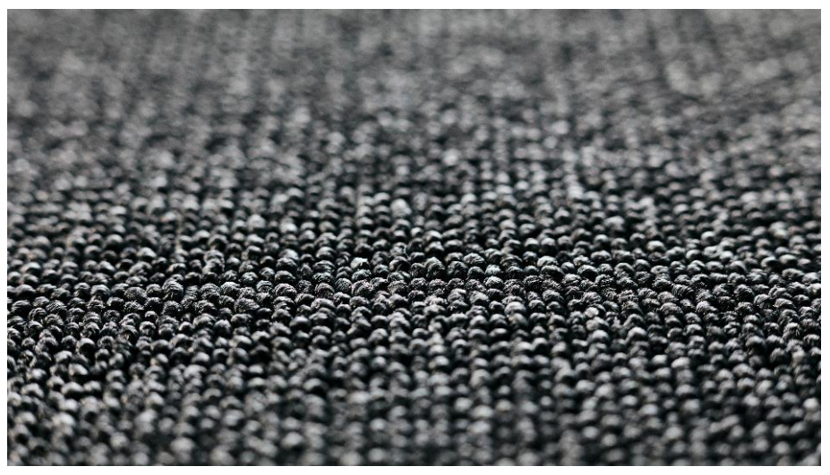
Mono-material carpet made of polyester

Video link to the event: https://www.youtube.com/watch?v=ldCfLnXrvn8