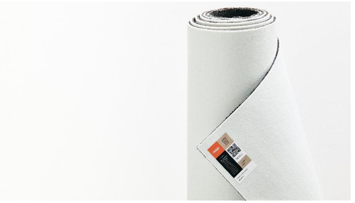
Carpet backing with Niaga® tag