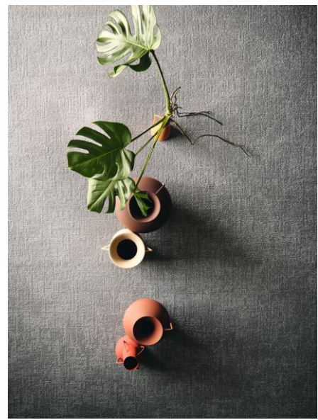
1840 and 1843 XPOSIVE

Inspired by the energy of expressive jungle landscapes, the XPOSIVE loop style offers a robust texture in a colour spectrum ranging from monochrome to high-contrast and has a flowing surface effect. Whether it is classic and understated or vibrantly expressive, XPOSIVE makes a statement and can be integrated into a wide variety of room concepts.