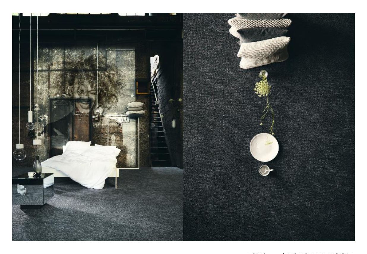
1853 and 1852 NEWCON

The interplay between high and low in the MOVE x GROOVE loop construction makes the surface look like it's moving. The carpet gives the impression of undulating playfully in the room and is always within easy reach, versatile and appealing in its effect.