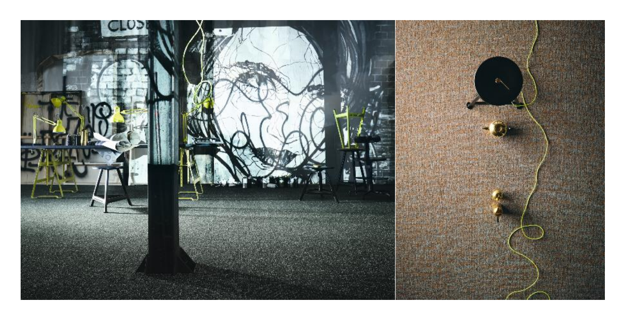
770 and 740 MOVE x GROOVE

The interplay between high and low in the MOVE x GROOVE loop construction makes the surface look like it's moving. The carpet gives the impression of undulating playfully in the room and is always within easy reach, versatile and appealing in its effect.