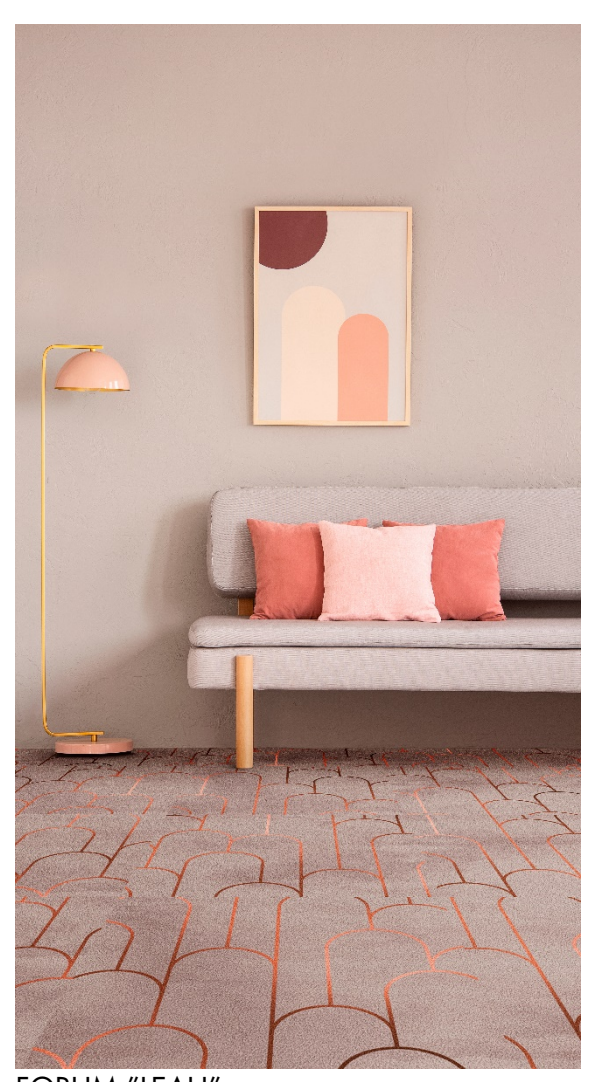
FORUM "LEAH"