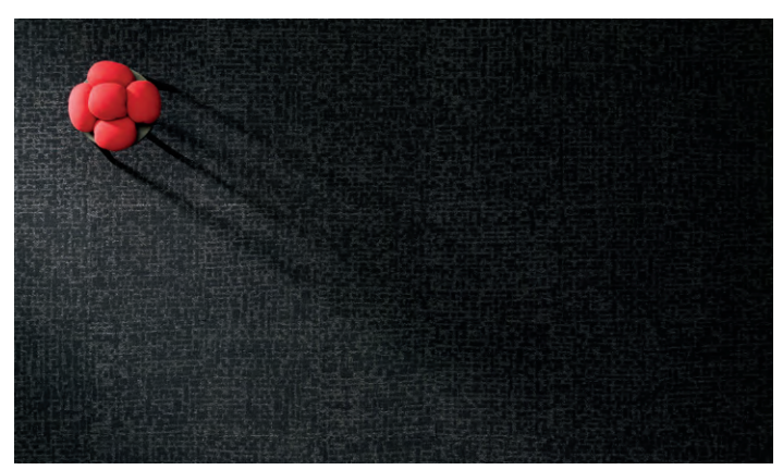
SL FOREST 700 WELLTEX (Places of Origin)