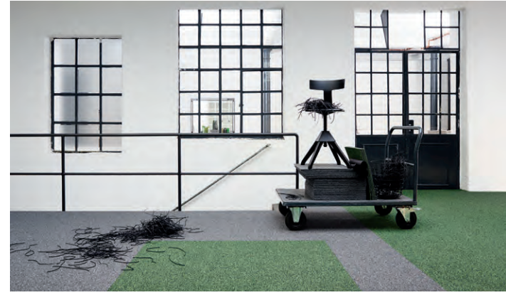
SL NYLLOOP 600 WELLTEX