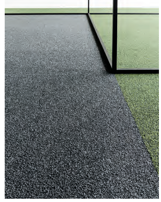
SL FINE 800 WELLTEX

"New requirements and improvements resulting from the latest technical developments are constantly integrated into our manufacturing processes," emphasizes Engelke. "Internal and external audits guarantee that all such improvement measures are consistently implemented. To ensure that only the best quality products leave our production facilities, we voluntarily submit all our flooring to various different tests and certification procedures. These include for instance the TÜV test of suitability for allergy sufferers and the GUT test for pollutant-free carpets. Lars Engelke is certain: "Creating flooring that has no ecological footprint - that is our ultimate aim. OBJECT CARPET products already leave as little waste as possible on our planet. Because in the end, our key priority is the health and well-being of our customers, and the protection of our environment."