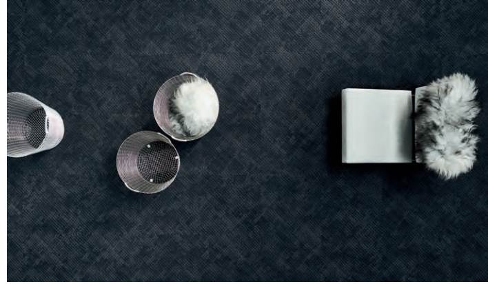
SL ARTIC 700 WELLTEX (Places of Origin)