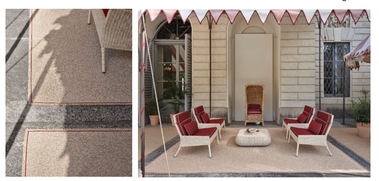
OBJECT CARPET MEDITERRANEO Riviera